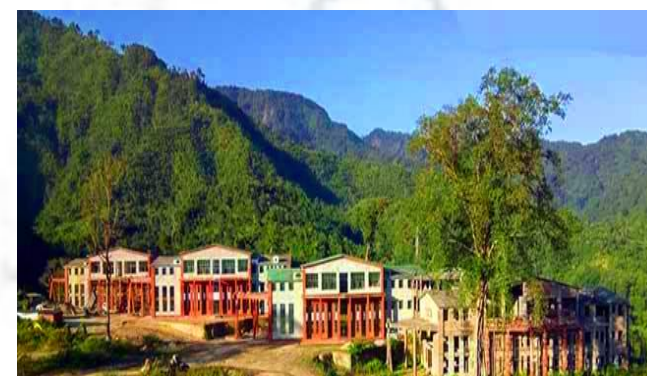
NIT, Arunachal Pradesh Jote Campus.